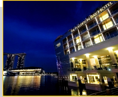
Façade of the Fullerton Bay Hotel