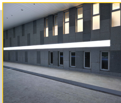
Illuminated path marking

With long service life of up to 45,000 hours, even lighting output and low power consumption, AluLED IP67 effectively cut necessary maintenance costs and significantly reduced CO 2 emissions and counter greenhouse effect.