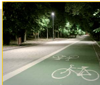
Safe roads thanks to intelligent lighting