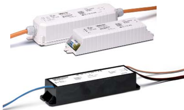
LED control gear with various output classes