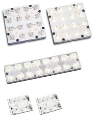
LED modules for outdoor use with various luminous fluxes and light distribution curves

Available in IP67 and dimmable variants (1–10 V interface), Protection Class II