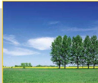
Easy on the environment and your pocket

In addition to our LiCS Outdoor light management system, we can also provide you with matching LED modules and LED drivers – the ideal system solution for a modern lighting concept. And from a single source.