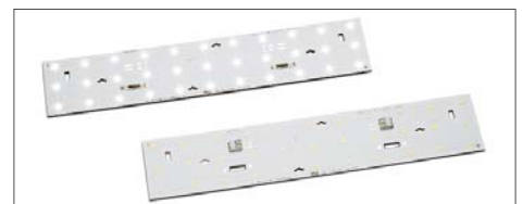
LED Line SMD W5.5

Last orders for all phase-out products can be placed until 15 December 2018 .