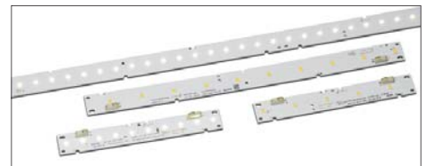
LED Line SMD W2

WU-M-507-G, 508-G, 509-G, 510-G, 511-G, 512-G, 552-G, 553-G, 559-G, 560-G, 544-G, 527-G