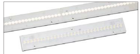
LED Line SMD W4

WU-M-480-G, WU-M-481-G, WU-M-501-G and WU-M-502-G